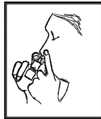
Figure 1 Illustration of the intranasal administration procedure.

Abbreviation: ASA, American Society of Anesthesiologists