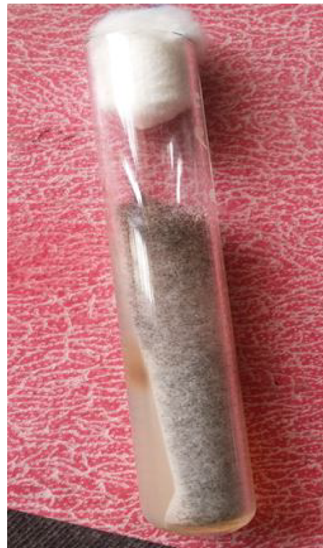
Figure 6 Rhizopus growth in Sabouraud's dextrose agar.

She was treated with intravenous liposomal amphotericin B, posaconazole, and timely endoscopic nasal debridements. Blood sugar was controlled with insulin. She improved symptomatically after 6 weeks of treatment, as evidenced