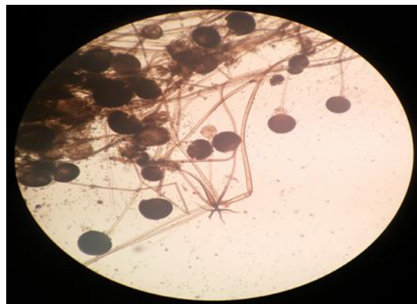
Figure 7 Filamentous branching aseptate hyphae with sporangia. Note: Magnification: 40 \times .