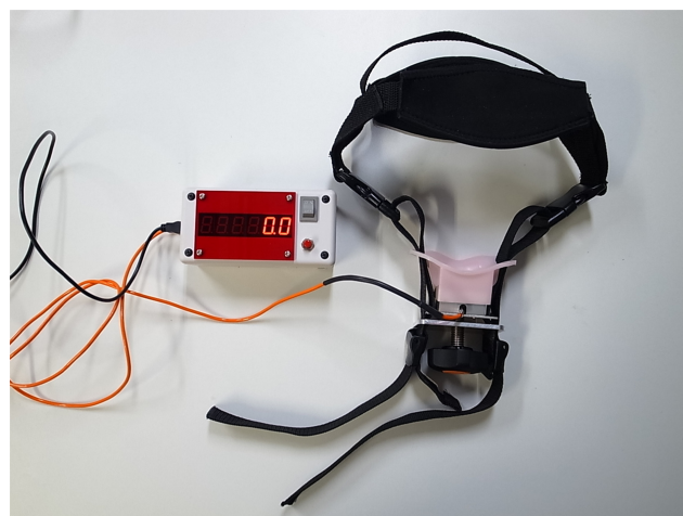
Figure 1 Jaw-opening sthenometer.

A coordinate system was established with the y-axis forming a straight line connecting the lower ends of the second and