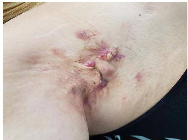
Figure 2 Hidradenitis suppurativa: clinical aspects.

In general, HS is localized in the apocrine gland-bearing areas of the body such as axillae, inguinal and anogenital regions, perineum, and inframammary area of female patients (although aberrant lesions may occur in the waist, abdomen, specially periumbilical region, and thorax). 1 The sites affected by HS correspond not only to the location of apocrine glands but also to the location of terminal hair follicles dependent on low androgen concentrations. 45 HS is initially characterized by the presence of tender subcutaneous nodules (commonly indicated as “boils” or “pimples”) (Figures 2 and 3). Up to 50% of patients report a burning or stinging sensation, pain, pruritus, warmth, and/or hyperhidrosis, 12–48 hours before