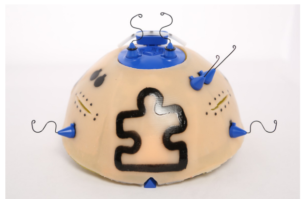
Figure 2 Fundamentals of Robotic Surgery dome device.

We believe that such a curriculum should encompass knowledge base (cognitive skill), tactile skill (psychomotor), and nontechnical skills (communication/team building). The basis for this curriculum should be surgical simulation, as it allows for safe acquisition of the necessary surgical skill in a controlled environment and then transference of this skill into live surgery. A curriculum should also be based on trainees achieving and demonstrating competence through identifiable outcome measures rather