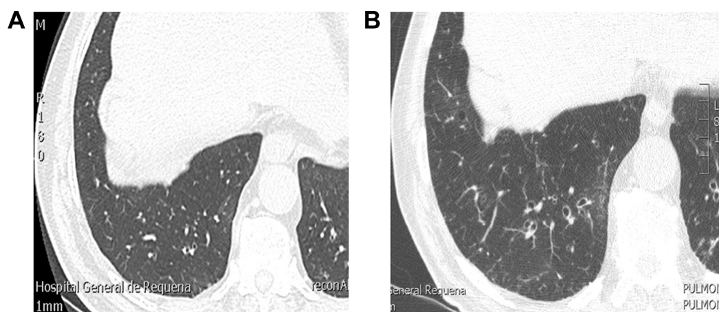
Figure 1 Development of bronchiectasis in a patient with severe COPD.

Subjects with COPD present different forms of impaired immunity that facilitate the survival and proliferation of