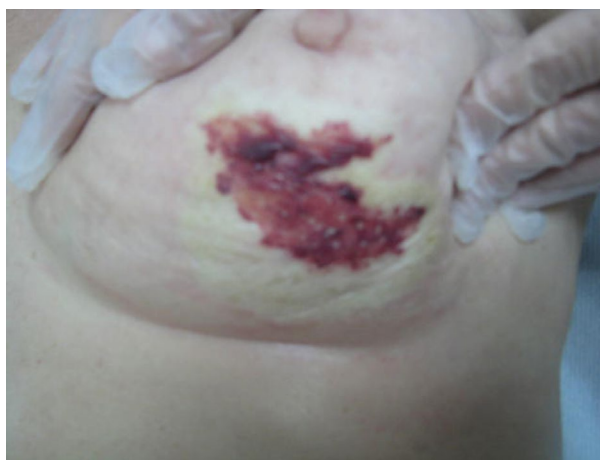
Figure 1 The picture shows the lesion characterized by a big morula and many pustules with a frail roof within hemorrhagic fluid, outlined by an edematous circular edge.

transparent epithelial coat surrounded by multiple frail and thin telangiectasias (Figure 2). These phenomena recurred every 4 to 6 months, involving at least the entire irradiated breast. The breast was severely retracted and distorted with edema of the subcutaneous plane and induration in the central part near the nipple area, with peripheral telangiectasias (Figure 3). We decided to review the RT treatment plan for possible errors in the radiation planning and delivery, and to check for possible under-estimated high hot spot (highest skin dose) areas, which could explain this phenomenon. However, the execution of the RT treatment was correct; in the evaluation plan the configuration of the isodoses, the dose/fraction, and the effective total dose administered were accurate. In the revision of the plan, only 105% little hot spot areas in the upper external part of the breast were recorded, while the area of the boost was in the superior external quadrant, outside the involved fibrotic breast.