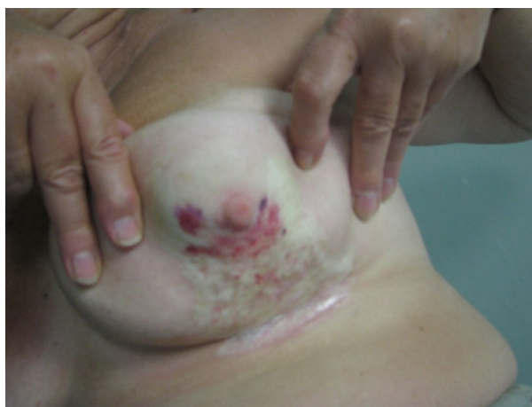
Figure 2 Two months after initial presentation, the involved area became pale, avascular, and covered by a transparent epithelial coat surrounded by multiple frail and thin telangiectasias with retraction of the skin in the inferior quadrants of the breast.