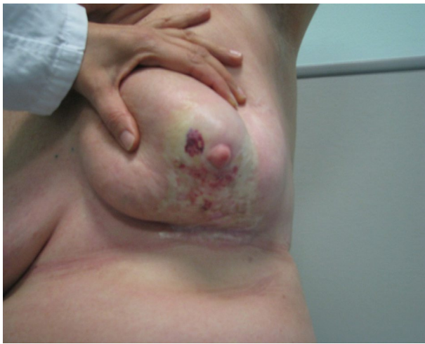
Figure 3 The picture shows a severely retracted and distorted breast with edema of the subcutaneous tissues as well as induration in the central part over the nipple area with peripheral telangiectasias.

To exclude a local relapse and to avoid a pressed trauma to the affected breast by the mammography, a breast magnetic resonance imaging (MRI) was prescribed. Breast MRI showed no relapse and a contrast enhancement of the dermal-epidermal surface with thickening of the skin contour as shown in Figure 4A and B. To exclude the suspicion of an active autoimmune connective-tissue skin syndrome, the patient underwent patch biopsy of the involved area. The biopsy revealed findings of chronic inflammatory diseases, such as panniculitis and chronic radiodermatitis, characterized by fibrosis and dermo-epidermal strippings, telangiectasias with thin and frail vessels (Figure 5). At this point, we hypothesized the possible role of polymorphisms in genes involved in DNA repair mechanisms. We therefore tested for SNPs in genes of interest on a peripheral blood sample using polymerase chain reaction and pyrosequencing. The tested genes were GSTP1 (A313G), XRCC1 (G28152A), XRCC3 (A4541G and C18067T), RAD51 (G135C), CYP3A4*1B , and CYP19A1 (C268T and G410T). The result showed heterozygous mutations in XRCC1 G28152A (T/C) and XRCC3 C18067T (A/G), homozygous mutation in GSTP1 A313G (G/G), and wild-type XRCC3 A4541G (A/A) and RAD51 G135C (G/G).