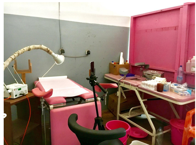
Figure 2 Device including the gynecological table, smartphone and tripod.

Once the patient record was created, the cervical images were acquired in a precise sequence: native, VIA, VILI and posttreatment whenever this was performed. The flash