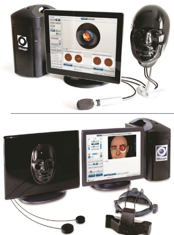
Figure 2 EYEsi Ophthalmoscope Simulator, developed by VRmagic. Note: Top, direct simulator; bottom, indirect simulator.

Although recent models are promising, there is still lack of studies to verify their actual efficiency and to compare recent models to traditional and rudimentary techniques. However, preliminary results presented in this review seem to be satisfactory. Further comparison studies are required for better characterization of newer simulation models.