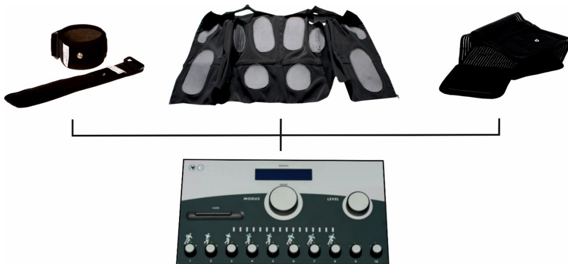
Figure 2 WB-EMS equipment with operator device and electrodes (vest, arm-, leg-, gluteal-cuffs). Abbreviation: WB-EMS, whole-body electromyostimulation.

participant during the second session and then again after 4, 8 and 12 weeks. The settings were saved to generate a fast, reliable and valid setting in the subsequent sessions. Based on these initial settings, instructors slightly increased (current) intensity every 3 min in close cooperation with the participants to maintain/slightly increase the prescribed RPE during the session.