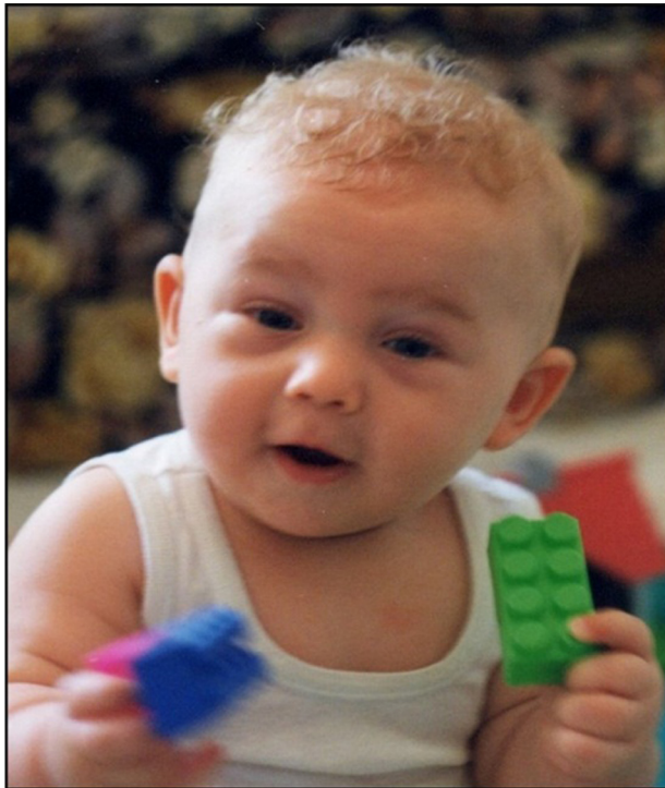
Figure 2 Facial features of the patient. Note: Our patient at the age of 13 months.

In the last few years, the use of comparative genomic hybridization array refined the molecular bases of developmental disabilities and psychiatric disorders associated with chromosome deletion/duplication. 8,9