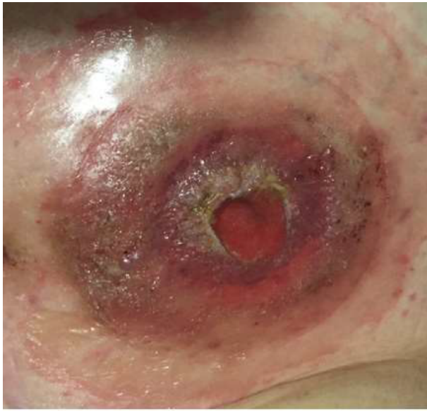
Figure 1 Dermatitis around the stoma before hematopoietic stem cell transplantation.