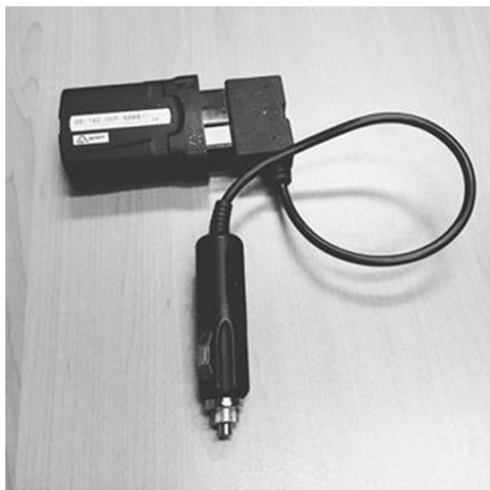
Figure 2 In-vehicle driver monitoring device.

self-regulating or non-self-regulating their driving in each of the driving situations. These situations included “driving on highways/freeways”, “on heavy traffic roads”, “in peak hour traffic” and “at night time”.