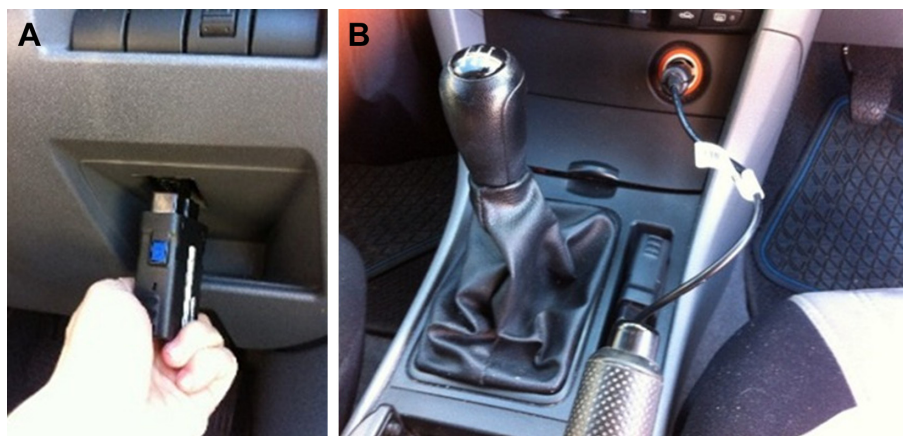
Figure 3 In-vehicle driver monitoring device inserted either into the On Board Diagnostic II (OBD II) port of the vehicle (A) or the cigarette lighter (B).

Participants were instructed to return the travel diary and the in-vehicle monitoring device at the end of the 7-day period in a pre-paid envelope. Participants were then interviewed to verify that there were no issues while using the device and that they were the only driver of the vehicle while using the device. The data from the devices was then read by Fleet management Software (MyGeotab, Oakville, Canada) and uploaded by the researchers to a secure server at the University. The data was cleaned in order to exclude trips made from the University, as they were not part of the participants’ typical driving behavior. Trips that lasted fewer than 10 seconds or 200 meters were also excluded in order to avoid “false trips”. The devices collected a variety of time stamped second-by-second GPS data, such as date of travel, location, type of roads used, start/stop times of trips, and distance traveled. Night time was defined as the period between sunset and sunrise. Peak hour was defined as driving between 6 and 9 am or between 4 and 7 pm, Monday to Friday. Each of the routes driven by participants were represented on an interactive map provided by Geotab, which identified whether participants drove on highways/freeways and/or heavy traffic roads. Heavy traffic roads were defined as roads where there were >4,000 vehicles per day per lane 38 (Figure 4).