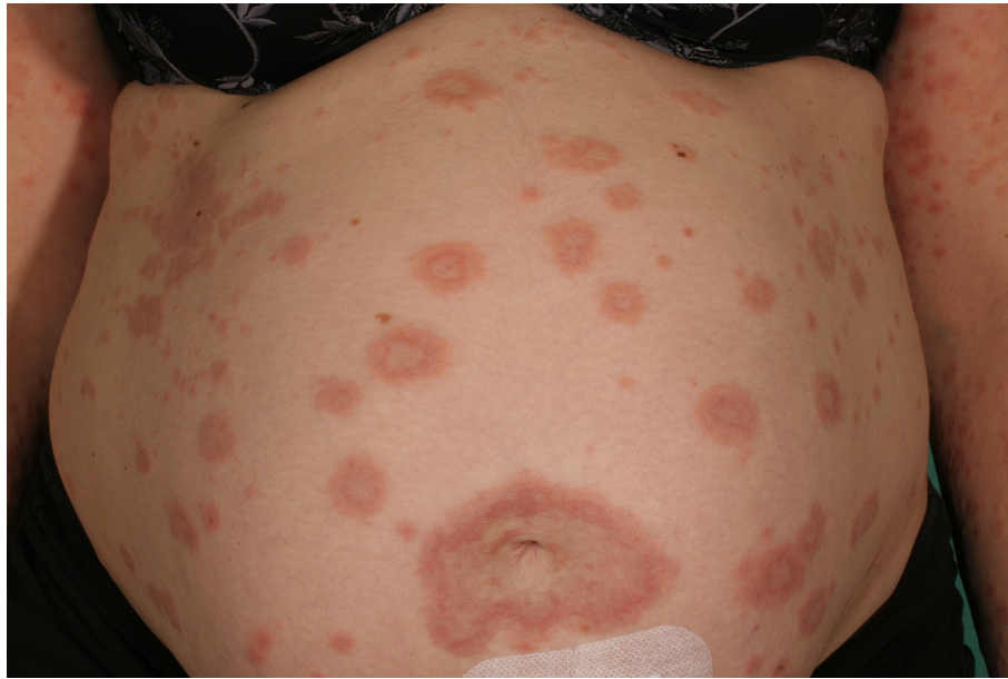
Figure 3 Erythematous, annular patches in pemphigoid gestationis.