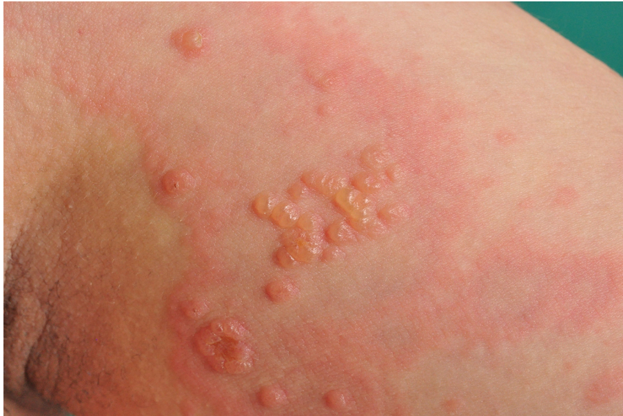
Figure 1 Blister formation in pemphigoid gestationis.

Many patients experience remission during late pregnancy, sometimes followed by a flare immediately after delivery. The flare usually settles over a period of 4 weeks without