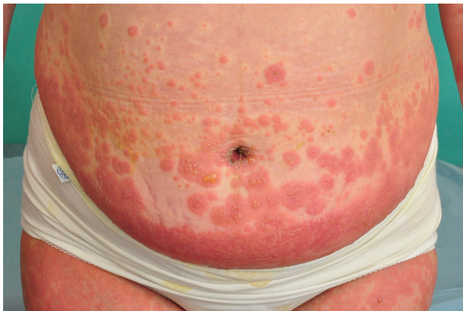
Figure 2 Umbilical involvement in pemphigoid gestationis.