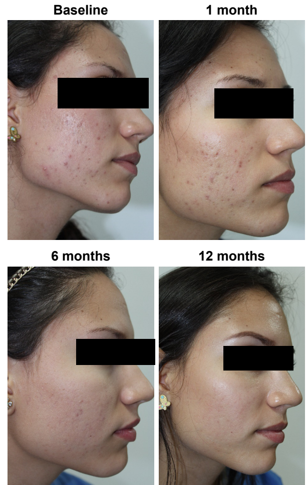
Figure 3 Photographs of the reduction in acne lesions.

15–45 years with low doses of ethinylestradiol 20 µg and other progestogen (drospirenone 3 mg) also had an effect in reducing inflammatory and non-inflammatory lesions. 24 The ethinylestradiol dose of 20 µg was selected in combination with dienogest in this study.