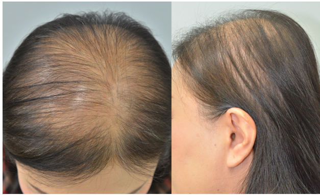
Figure 3 The clinical presentation of FPHL reveals distinctive hair thinning mostly confined to the midscalp and parietal areas.

Note: The frontal hair line is usually spared.