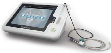
Figure 3 The Phagenyx® system.