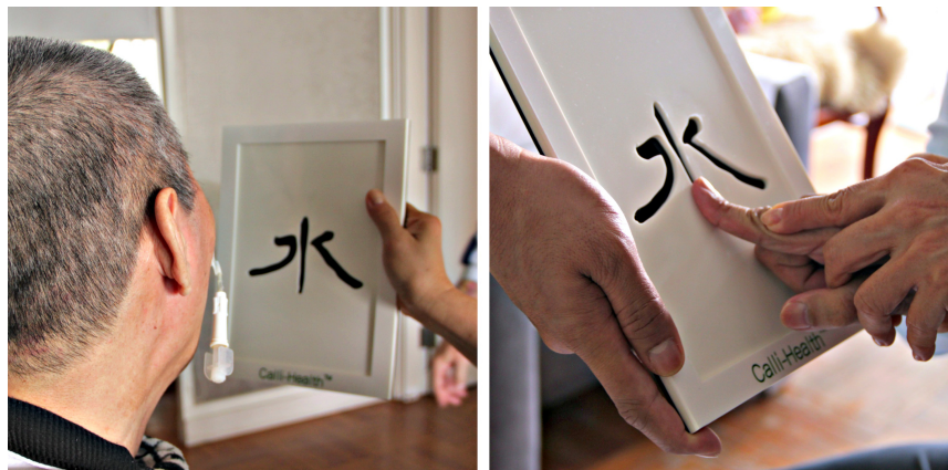
Figure 4 Calligraphy training being conducted on the patient with the help of three nursing staff. One helped him to sit up and position his head upright, the second one helped and directed his attention and showed him to focus on the task character (top left), and the third one held his index finger and ran it through the strokes of the Chinese character on the board (top right).