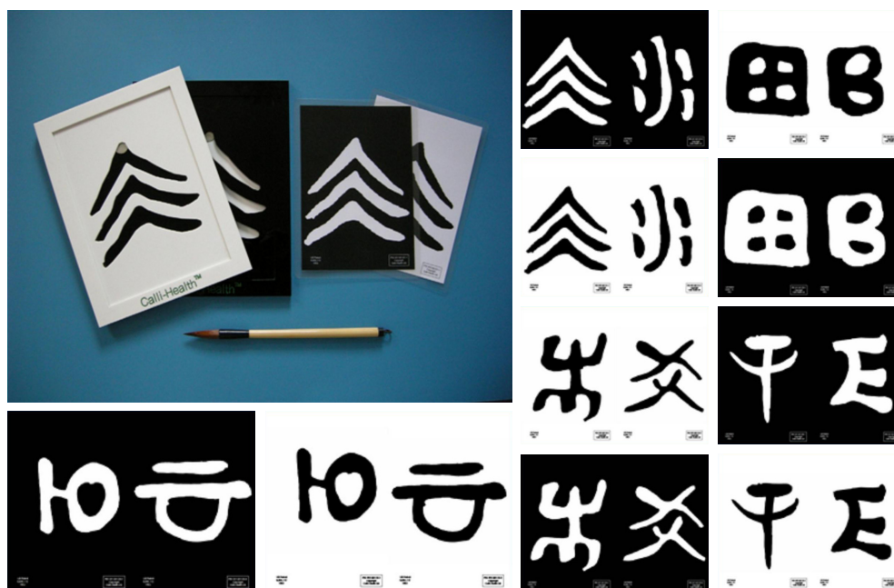
Figure 1 Some of the special characters and the design of the writing plates with grooved characters.

total of 10 character finger writing were performed for each training session. The schedule included 3–5 sessions per week and 4 weeks per month.