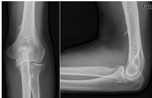
Figure 3 Supracondylar process is seen on simple X-ray anteroposterior and lateral (lat) radiographs.