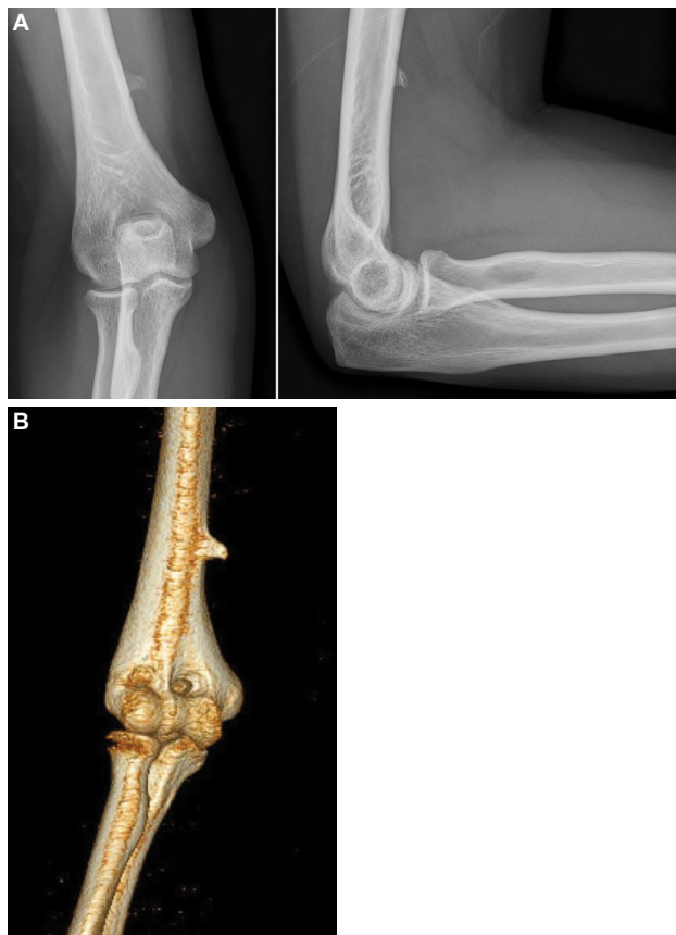
Figure 1 (A) Simple X-ray image with anteroposterior and lateral radiographs showing the supracondylar process. (B) Supracondylar process observed on 3-dimensional computed tomography.

A 36-year-old right-handed woman presented with pain in the medial aspect of the right elbow joint, which progressively worsened 3 months ago, with numbness in the distribution of the median nerve. Her symptoms were aggravated by continuous movement and local compression. Because of pain, the patient had visited a private clinic and received injections several times without any benefit. Physical examination revealed tenderness and a Tinel's sign in the medial epicondyle. Her ulnar nerve was normal without weakness or sensory abnormality, and normal muscle strength was observed in the flexor pollicis longus and flexor digitorum profundus. A bony projection was felt at a site ~8 cm proximal to the medial epicondyle. A supracondylar process was found on X-ray images and computed tomography (Figure 1A and 1B). Surgery was performed under general anesthesia. The supracondylar process, which was 11 mm in length and 6 cm above the medial epicondyle, was exposed through a medial approach (Figure 2A). The ligament of Struthers connected the supracondylar process and medial