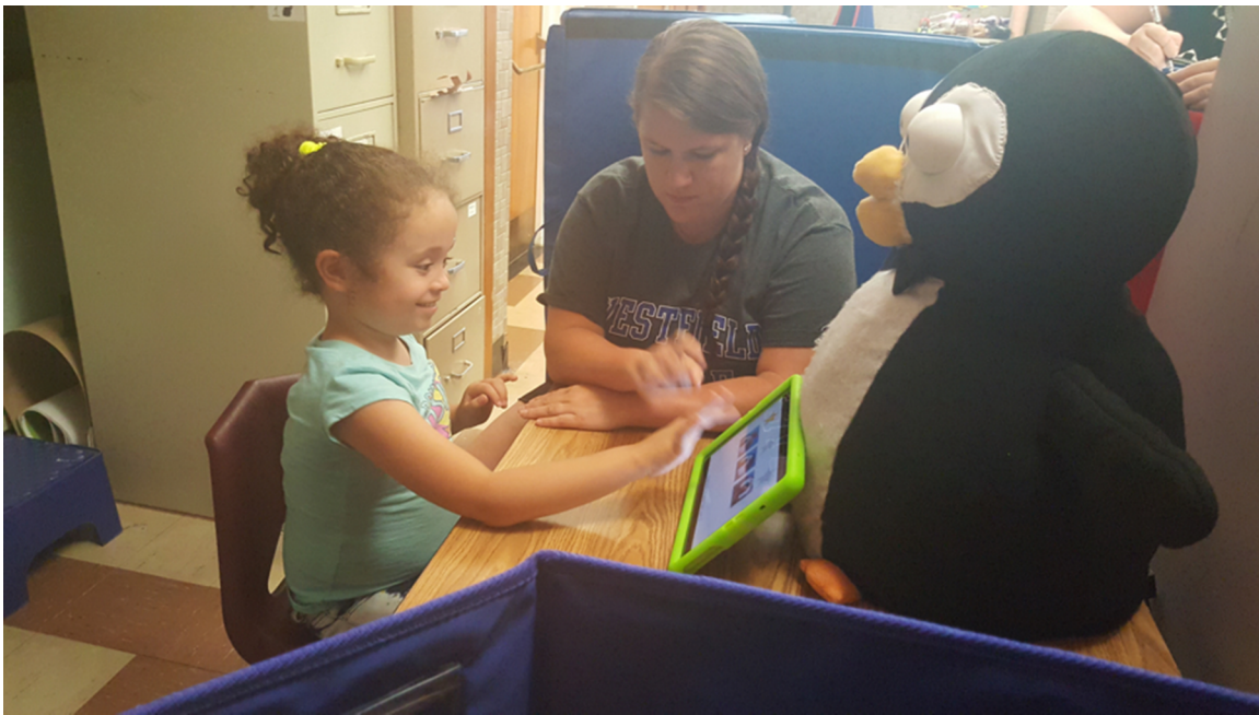
Figure 1 The PABI robot in a triadic therapy scenario providing DTT ABA therapy for an autistic child in conjunction with a therapist.