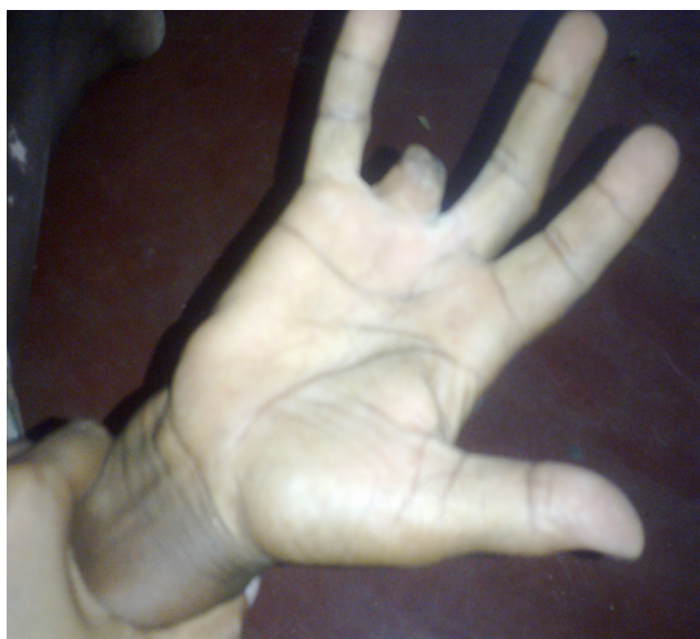
Figure 3 Amputation of ring finger of the right hand due to snakebite.

exposure to sunlight. In one, loss of vision was apparent. Russell's viper, cobra, and krait were the offending snakes in 42.9%. The complication was disabling with difficulty in reading and recognition of persons.