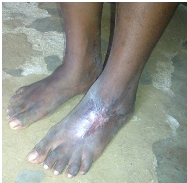
Figure 2 Soft tissue contracture of the left foot following snakebite.