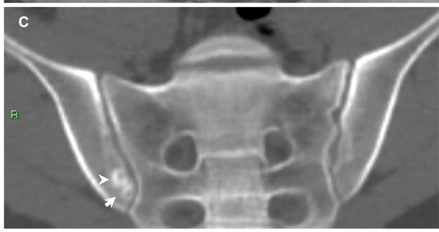
Figure I Early sacroilitis. Notes: Semicoronal MRI T2-weighted with fat saturation (A), TI-weighted (B) and semicoronal CT reconstruction (C) images of the SIJs of a 21 year old male with early sacroilitis. BME is clearly seen on the right iliac side of the joint (arrowheads in A) as well as small erosions at the same location (arrowheads in B and C). Abbreviations: BME, bone marrow edema; CT, computed tomography; MRI, magnetic resonance imaging; SIJ, sacroiliac joint.

minor BME may be seen in many clinical situations and even in healthy individuals, thus a certain threshold of BME and pattern recognition (ie, differentiating between specific disease entities based on the pattern of BME distribution along the joint) needs to be employed when diagnosing