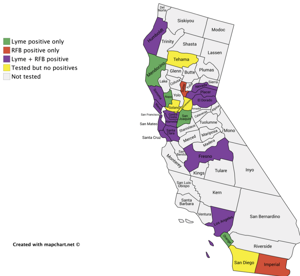
Figure 2 Map showing distribution of Lyme, RFB and Lyme + RFB testing in California counties, October 2016 through May 2018.

Notes: Patients from 24 counties were tested. Lyme testing alone was positive in four counties, RFB testing alone was positive in two counties, Lyme + RFB testing was positive in 14 counties, and no positive testing was found in four counties. Map created using https://mapchart.net/ . 45