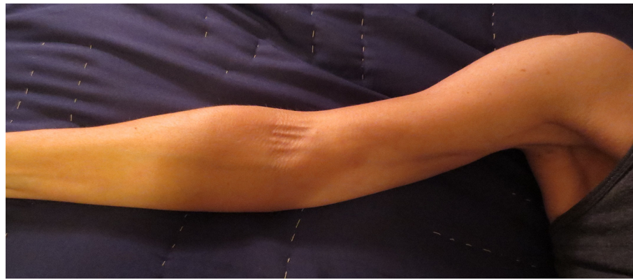
Figure 2 Axillary web syndrome of the right extremity.

Note: Multiple cords are visible in the axilla and medial upper extremity with extension into the antecubital fossa.