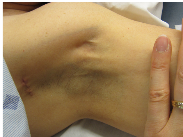
Figure 1 Axillary web syndrome of the left axilla. Note: Multiple cords are visible in the mid axilla.

Patients with less rigid or shorter cords may have minimal cord tension and minimal symptoms until they approach full extension and abduction. In our experience, they frequently describe arm movement as feeling “different” or “not nor-