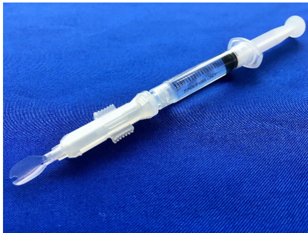
Figure 1 The NS Endo-Inserter developed for graft insertion during Descemet stripping automated endothelial keratoplasty.