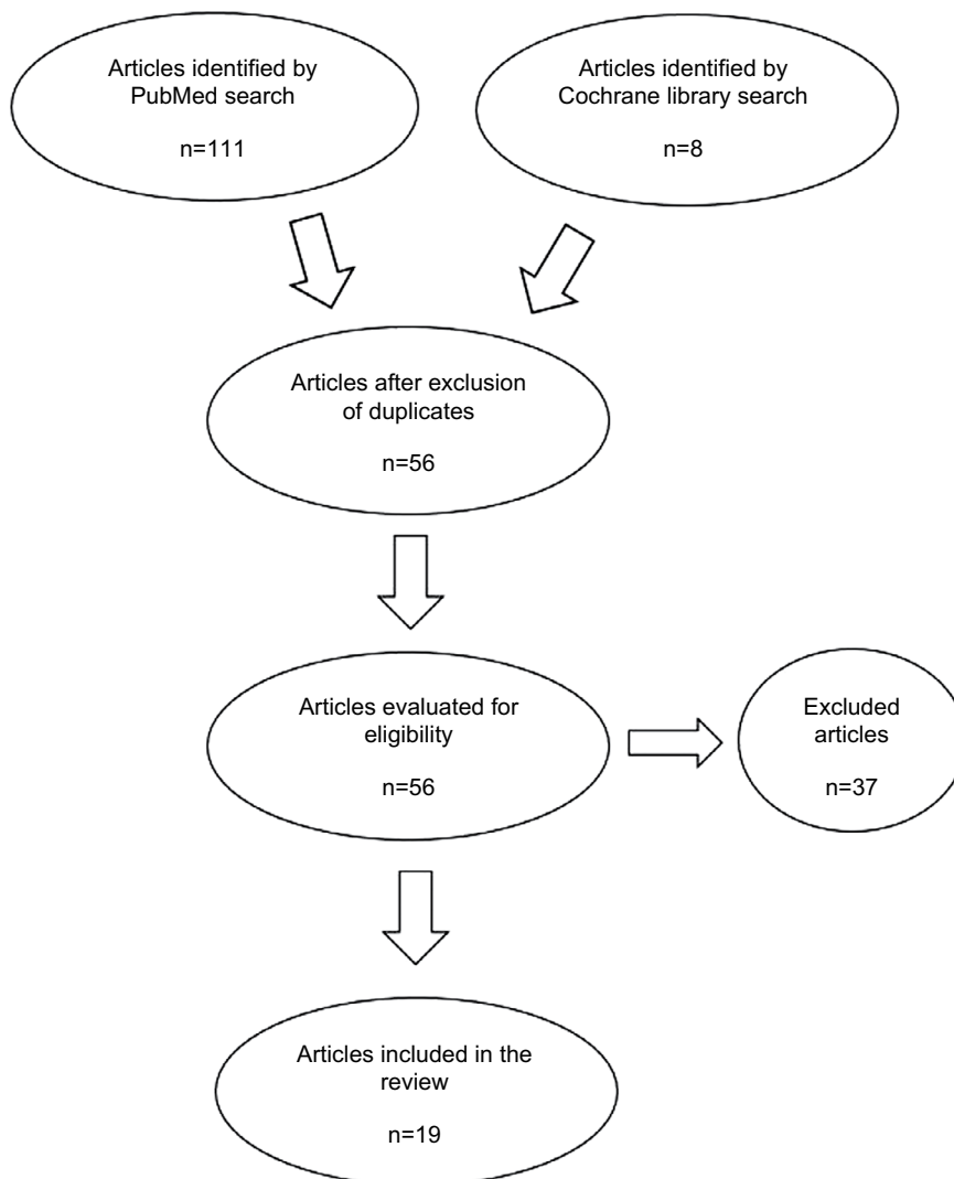
Figure 1 Flow chart for search and selection of articles.

The etiology is not completely clear and is still being debated. Muscle imbalance between the abdominal and hip