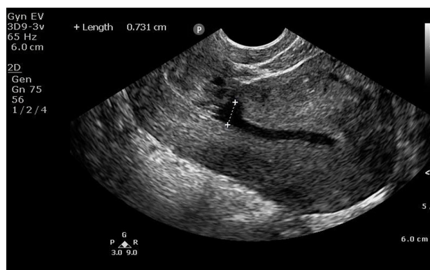
Figure 2 Cesarean scar defect by 2D ultrasound.

Ahmed et al conducted a clinical trial to evaluate the effect of routine cervical dilatation during elective CS on maternal morbidity on 131 patients. They found that cervical dilatation did not reduce the risk of postoperative maternal fever or wound infection. 5 Tosun et al conducted a randomized trial to investigate the necessity of cervical dilation in elective CS on 150 patients. They found similar results as previous studies, but the only difference was that the endometrial thickness was more in non-dilated cervix group than in dilated cervix group (9.51±3.35 vs 6.87±2.50 mm). They explained that thick endometrial cavity may be due to presence of retained fluid and blood in the uterine cavity, increasing the occurrence of hematometra. 17 Similar results regarding endometrial thickness were obtained by Sakinci et al. 21