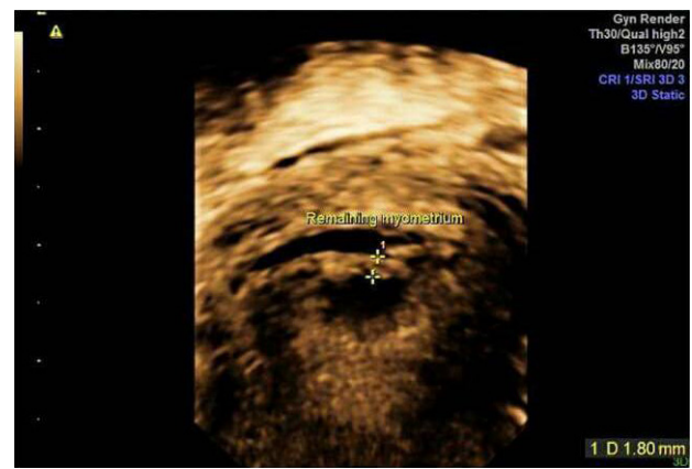
Figure 3 Residual myometrial tissue assessment by 3D ultrasound in no cervical dilatation group.

Recently, Kirscht et al conducted a randomized controlled study (Dondi Trial) on 447 patients to assess the effects of cervical dilatation on postoperative morbidity. They found no significant difference in infectious morbidity between the two groups. The only difference reported was that the retained products of conception were nil in the dilatation group compared to 6.2% in the no dilatation group ( P < 0.001 ). 20