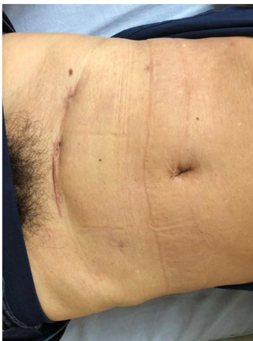
Figure 2 Pfannenstiel incision made 2–3 cm above the symphysis pubis at the border of the pubic hair.