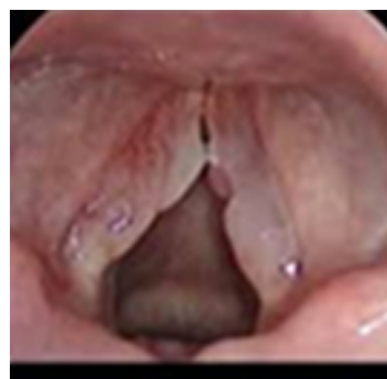
Figure 1 Laryngoscopy at diagnosis.

Surgery was advised as a primary therapeutic approach, but the patient refused laryngectomy and accepted a definitive