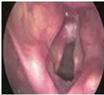
Figure 4 Laryngoscopy after 60 Gy radiotherapy.

Note: In this image, a clear resolution of the glottic–subglottic stenosis and the tumor is represented.