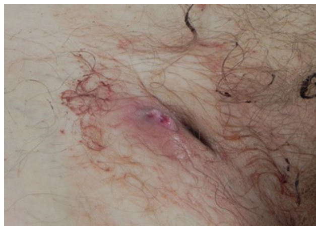
Figure 1 Right groin sinus in a patient with a history of IVDU.

Duplex may have a role in the investigation of patients where the diagnosis is uncertain. The sensitivity and