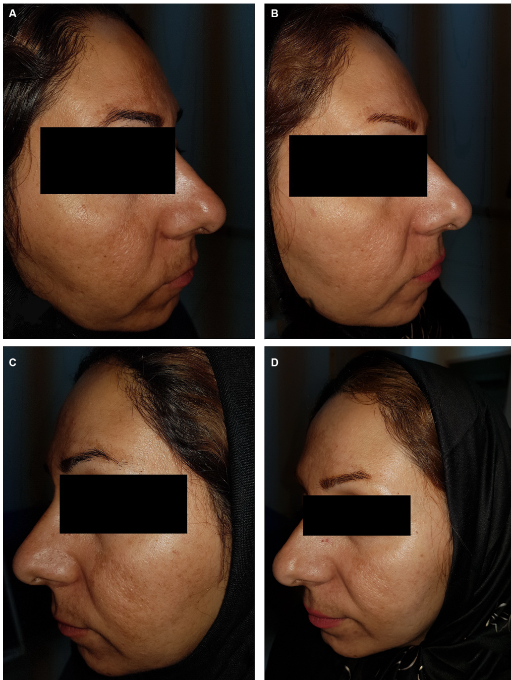
Figure 4 Before treatment with 10 mg/mL TA (A), after treatment with 10 mg/mL TA (B), before treatment with HQ (C), and after treatment with HQ (D).

observed between 4 mg/mL and 10 mg/mL. Furthermore, compared to Sharma et al's 23 study, mean reduction of MASI score in our study was lower. This may be due to many factors such as genetics, severity, duration and type of melasma, study design, etc.