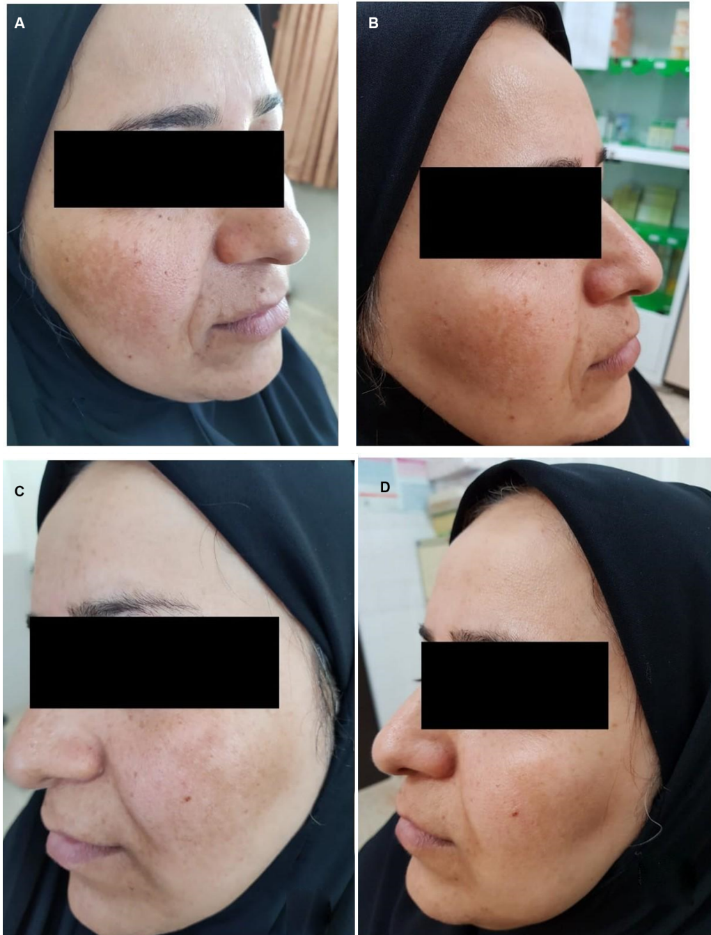
Figure 3 Before treatment with 4 mg/mL TA (A), after treatment with 4 mg/mL TA (B), before treatment with HQ (C), and after treatment with HQ (D).

Intradermal injection of TA seems to be a safe treatment for melasma. Dose of TA and duration and interval of administration has been different in the previous study, but they all reported beneficial effects. The advantages of this study were the presence of the hydroquinone as the control group and higher concentration of TA; however, no difference was