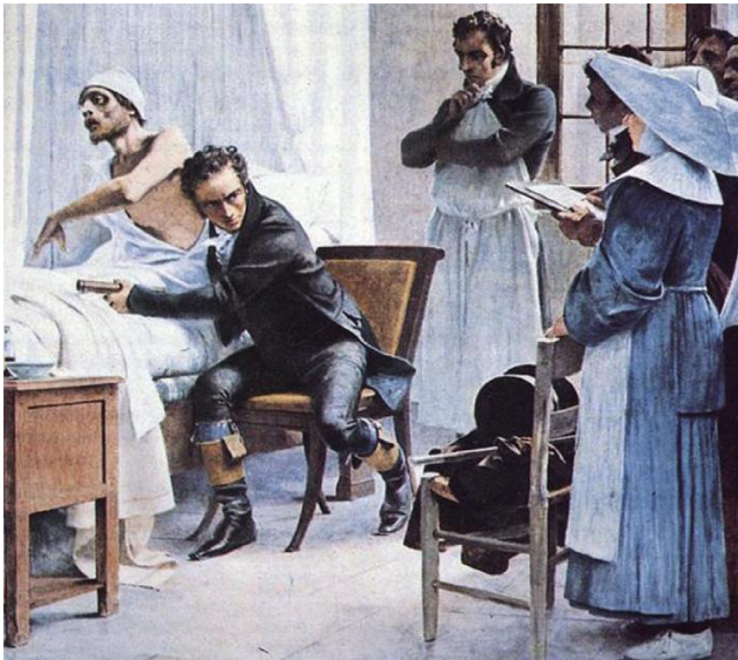
Figure 2 Laennec at the bedside performing direct auscultation.

Notes: Image from the U.S. National Library of Medicine. Painting by Théobald Chartran (1849–1907).