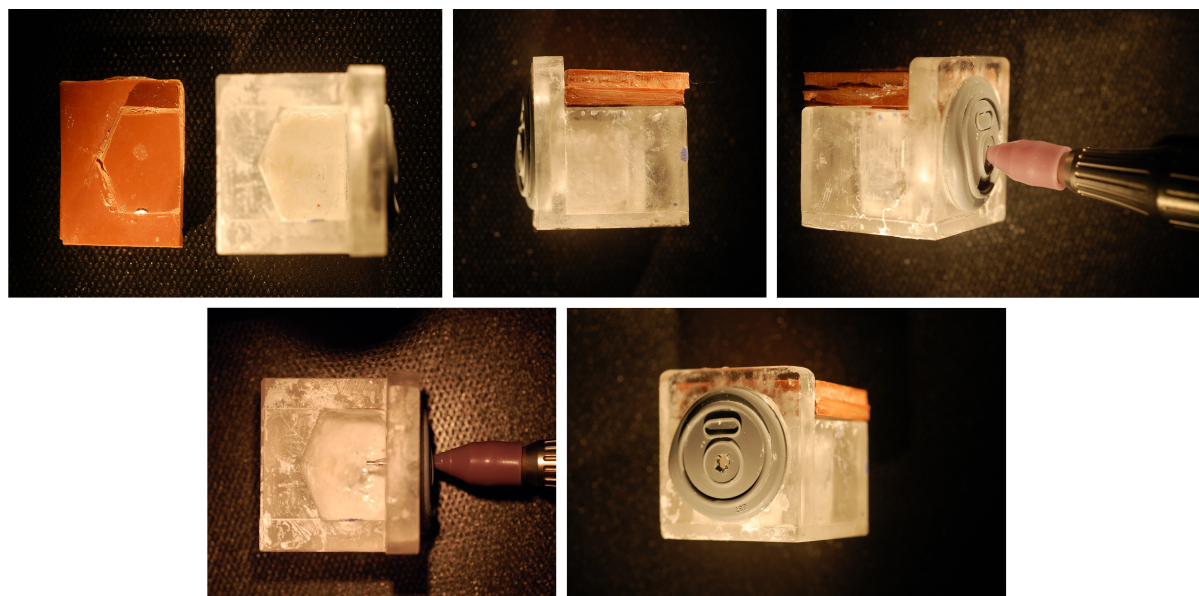
Figure 1 Aerial view of the groover with lid removed (upper left), front view of the groover (middle left), side view of the groover with the handpiece in (upper right), aerial view of the groover with the handpiece in (lower left), and side view of the groover (lower right). The interior of the chamber measures 16 mm in width, 16 mm in length (from the front to the pentagon's point, which is the back of the chamber), and 16 mm tall.

Efficiency was defined as the number of seconds that ultrasound was used for lens fragment removal. Efficiency