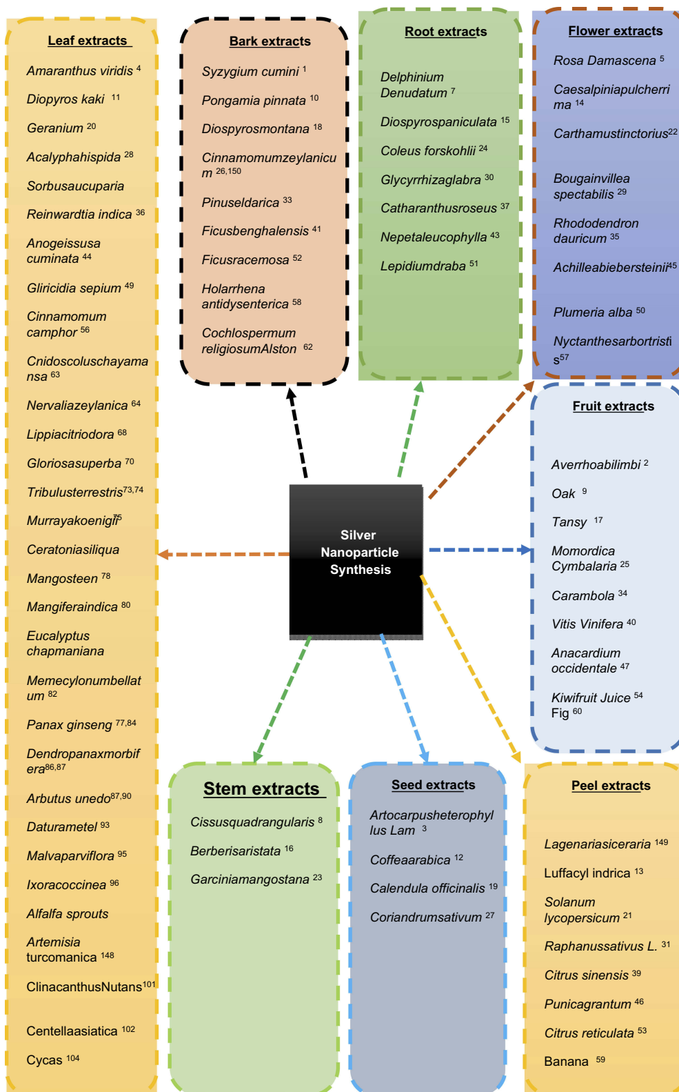
Figure 3 Plant mediated synthesis of AgNPs.