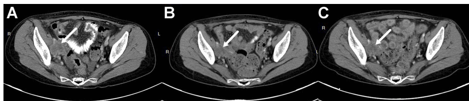
Figure 2 The CT scan of the cervical cancer patient.

In addition, to block the VEGF signaling pathway by working as TKI inhibitor, apatinib also inhibits the ABC (ATP-binding cassette) proteins which play critical roles in chemo-resistance. 17 It is well understood that ABC protein protects cancer cells by pumping out toxicity drug. In the preclinical study, concomitant treatment with paclitaxel, a most used toxicity drug, apatinib significantly increased the susceptibility to paclitaxel in either cervical cancer cells or the mouse model. 11 Cisplatin is the most effective single chemo-reagent for cervical cancer. Unfortunately, cisplatin treatment frequently results in the development of drug resistance after initial responses in various cancer. 18 Apatinib can restore the sensitivity of cancer cells to cisplatin by down-regulating the expression level of multi-drug resistance-1 and inhibiting the