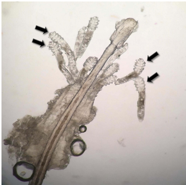
Figure 1 Demodex folliculorum mites on a lash follicle (black arrows).