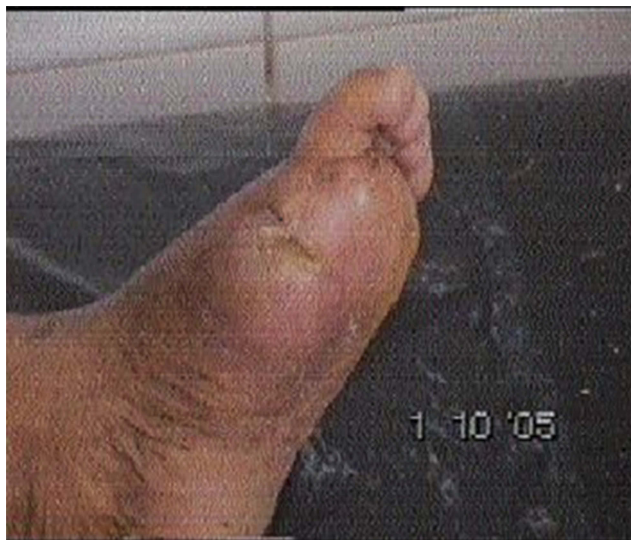
Photo 4 Lesion of patient 2 after 2 months of treatment.

signal transducer and activator of transcription 3. 17 RJ stimulates the production of type I collagen and bone formation through action on osteoblasts. 18 The expression of vascular endothelial growth factor gene was found to be stimulated by subcutaneous injection of RJ in experimental animals. 19