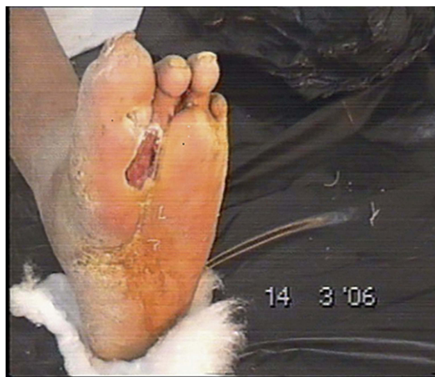
Photo 2 Lesion of patient 1 after 4 months of treatment.

dendrocytes) and increases the mRNA expression of the potent glial cell line-derived neurotrophic factor. 16 Through its active compound, “AMP N1-oxide”, RJ facilitates neurogenesis by stem cells through activation of