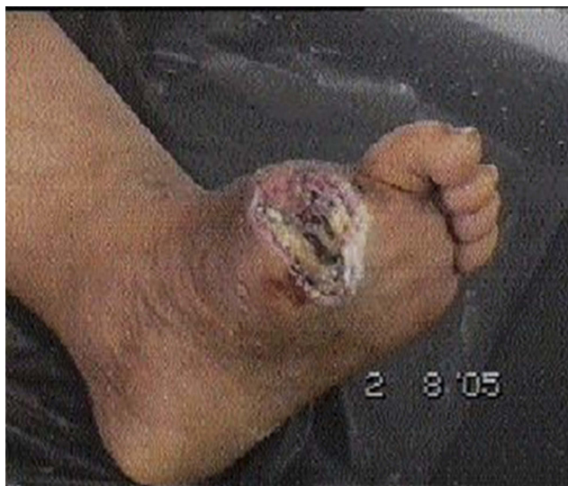
Photo 3 Lesion of patient 2 before treatment.