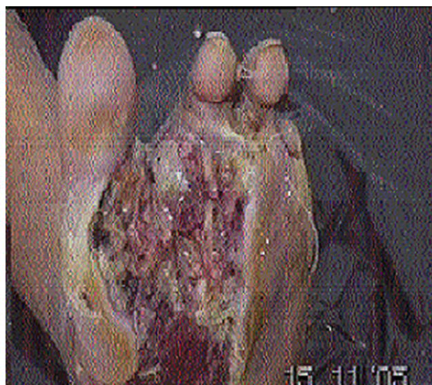
Photo 1 Lesion of patient 1 before treatment.

RJ was shown to facilitate in-vitro the differentiation of all types of nerve cells (neurons, astrocytes and