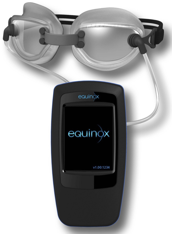
Figure 1 Multi-pressure dial, which includes the goggles connected to a handheld pressure-modulating pump. This device was worn for the duration of the 8-hr study period in this study.

The short-term safety of the MPD has been established with key safety parameters remaining unchanged after a 30-min wear in a prior study by Thompson et al. 4 The goal of this study is to evaluate safety and tolerability of the MPD for an extended, uninterrupted duration (8 hrs).