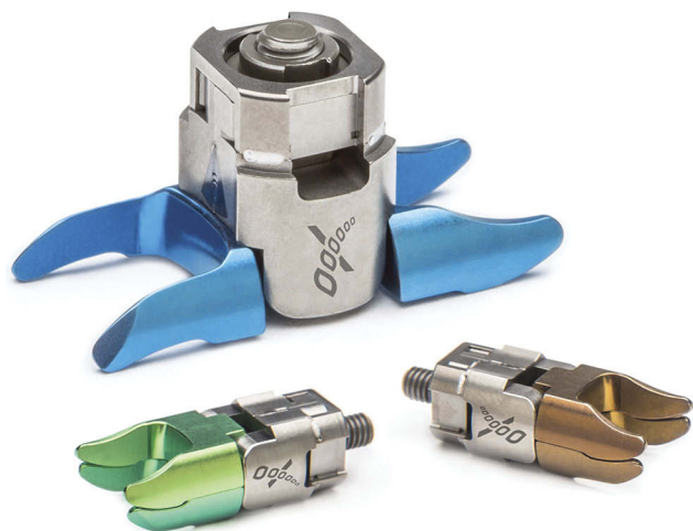
Figure 1 Superior ® indirect decompression system.