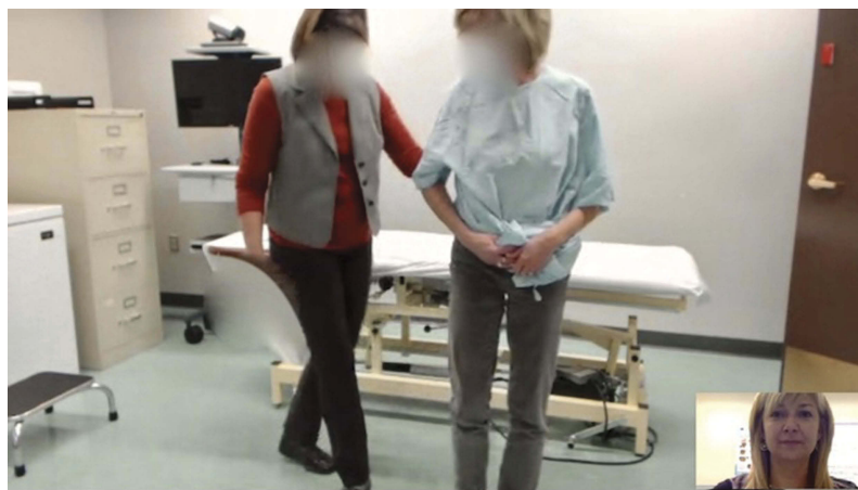
Figure 1 Physical therapist (shown in inset) view of nurse practitioner and model patient, using Vidyo secure web-based telehealth platform. 27 The physical therapist has provided written informed consent for her photo to be included in this manuscript.

The team used a laptop with VidyoDesktop Software Inc. (Vidyo Inc, Hackensack, NJ, USA). 27 An external web camera with pan, tilt, and zoom functionalities was located at the NP and patient site; this device transmitted audio and video to the consultant urban PT. Figure 1 shows the viewpoint of the urban-based PT. A full neuromusculoskeletal assessment for the lumbar spine was completed on each patient. Patients were provided with a lay summary of assessment findings, management recommendations, and education regarding expectations for treatment needs, as well as answers to any questions they had.