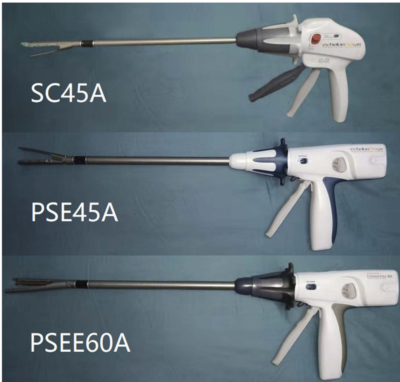
Figure 2 Images of staplers used in the study: SC45A, PSE45A and PSEE60A.

and the HCs were $3625 and $10,177, respectively. Of the endoscopic products used, the PSEE60A ($4865) stapler