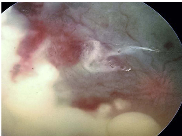
Figure 4 Fundus retinography of Aspergillus endophthalmitis showing vitritis, dense and wide white-yellow creamy lesions, diffuse intraretinal hemorrhages, partial retinal detachment.

Vinekar et al presented a series of 6 eyes affected by fungal endophthalmitis ( Aspergillus and Candida ) following cataract surgery with a mean of 4.16 recurrences. 58 The median interval after cataract surgery at presentation was 7 weeks. The eyes showed persistent infection despite a mean of two vitrectomies, systemic and intraocular use of antifungal agents, even newer agents like voriconazole. Following a final vitrectomy and IOL explantation with careful removal of the capsule, they were able to prevent further recurrences during a mean follow-up period of 36.5 months. The Authors suggested that the fungal spores are