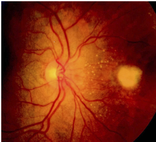
Figure 3 Fundus retinography of Aspergillus infection involving the posterior segment: subretinal exudates, intraretinal hemorrhages spread into the retina extended to the posterior pole.