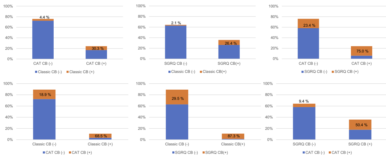
Figure 2 Discrepancies in patient groups among the three different definitions of CB. Abbreviations: CB, chronic bronchitis; SGRQ, St. George’s Respiratory Questionnaire; CAT, COPD Assessment Test.

The present study was performed to investigate two alternative definitions of CB, using SGRQ and CAT subscale scores pertaining to cough and sputum production, which could replace the classical definition. We compared the clinical parameters of CB and non-CB patients classified according to each definition, and the results showed that CB patients classified according to both alternative definitions showed similar results regarding clinical manifestations compared to those classified according to the classical definition. According to both of the new