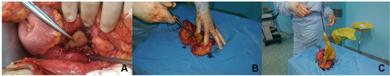
Figure 2 (A–C) Intraoperative laparotomy and sponge extraction.