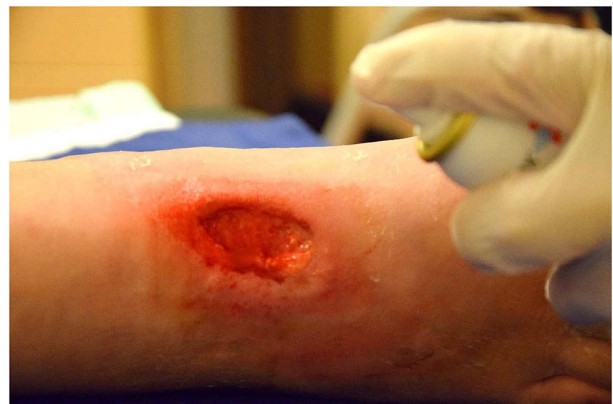
Figure 2 Application of haemoglobin spray as thin layer onto a diabetic foot ulcer after wound cleansing.

Expert consensus recommendations guide that topical haemoglobin should be considered for wounds which are considered as being, or at risk of becoming, chronic that have failed to respond substantially to best practice standard care treatment after 2–4 weeks. An improvement in wound healing should be observed at least after 4 weeks of the adjunct haemoglobin application. 49,50