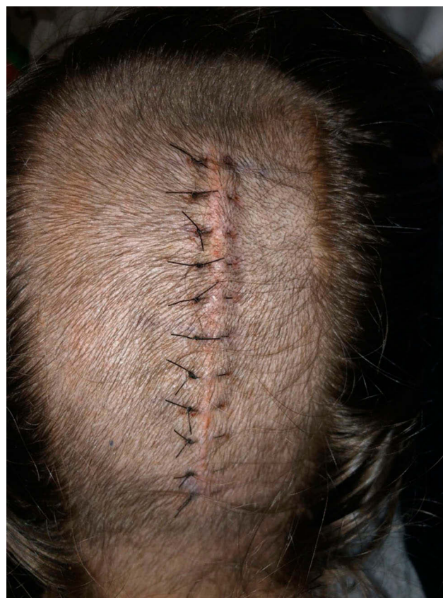
Figure 2 Pineal cyst resection – craniotomy incision.

An 18-year-old obese female with a body mass index of 33.4 and a history of irritable bowel syndrome (IBS) and severe gastroparesis presented to APMS during readmission for inability to tolerate oral intake following supracerebellar transtentorial resection of 10 cm pineal cyst. Patient's incision is shown in Figure 2. She had been discharged home on postoperative day (POD) two and readmitted for severe headache, nausea, vomiting, and constipation on POD three. The headache was primarily localized to the frontal region with associated photophobia. Neurologic exam was nonfocal, and imaging of the head revealed expected postoperative changes. She was started on acetazolamide 500 mg BID, dexamethasone 10 mg intravenously followed by 4 mg