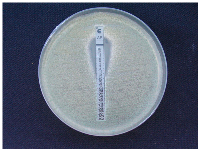
Figure 2 Amphotericin B E-test strip on RPMI medium showed a MIC of 1 µg/mL (susceptible to amphotericin B).

major limitations of this study was the lack of information about this test among patients. Some investigations reported that A. fumigatus is more common in the Western countries, whereas A. flavus is more prevalent in the Asia and Middle East. 31,32 In the present work, 33.3% of cases with onychomycosis were recognized; while, Veer et al, 33 and Wijesuriya et al, 34 reported 48.885% of onychomycosis from India and Sri Lanka, respectively. Naghibzadeh et al, 35 detected 1.2% of Aspergillus sinusitis in Tehran, Iran, from 2007 to 2009, whereas 15.9% of Aspergillus sinusitis was reported in the present research. This significant difference could be related to the climatic conditions of the two regions or the duration of investigations. Ebadollahi-Natanzi et al, 36 detected 32 patients (26.4%) with fungal keratitis due to the Aspergillus spp. from Tehran, Iran, between 2011 and 2013,