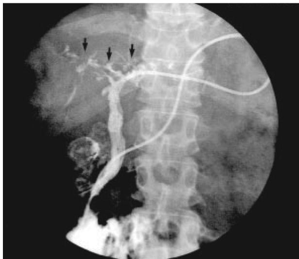
Figure 3 T-tube cholangiogram shows features of diffuse ischemic biliary stricture (arrows).

Information regarding the status of the donor and the pathology of the explanted liver, which are crucial for subsequent management and follow-up, and for indicating possible complications, were often missing. This added to difficulties in the clinical management of this group of patients.