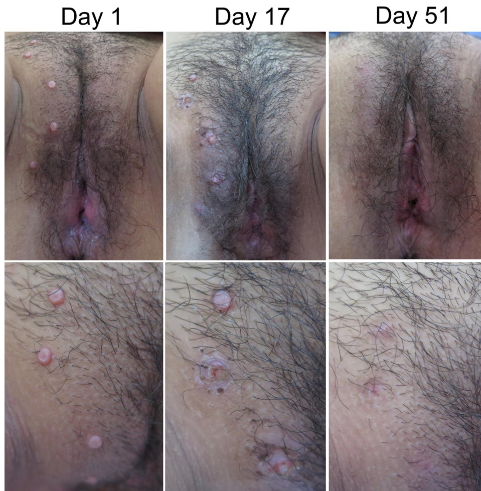
Figure 1 Clinical manifestation of molluscum contagiosum on genital area before and after 20% KOH treatment. All of the MC lesions disappeared and became post-inflammatory hyperpigmentation on day 51 of observation.

Abbreviations: KOH, potassium dihydroxide; MC, molluscum contagiosum.