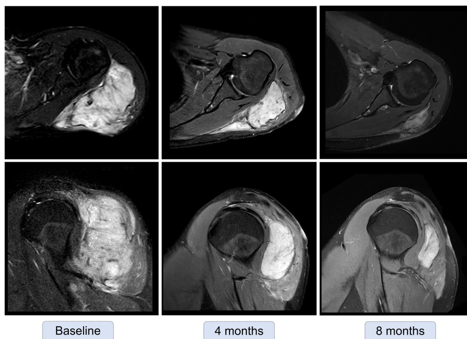
Figure 2 A 27-year-old patient with the partial disease after eight months of anlotinib treatment.